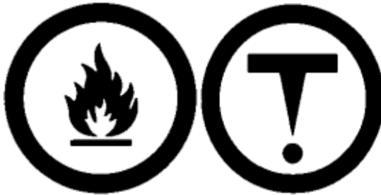
NFPA Hazard ID

WHMIS Hazardous Class: B2 Flammable Liquids D2B Toxic Materials